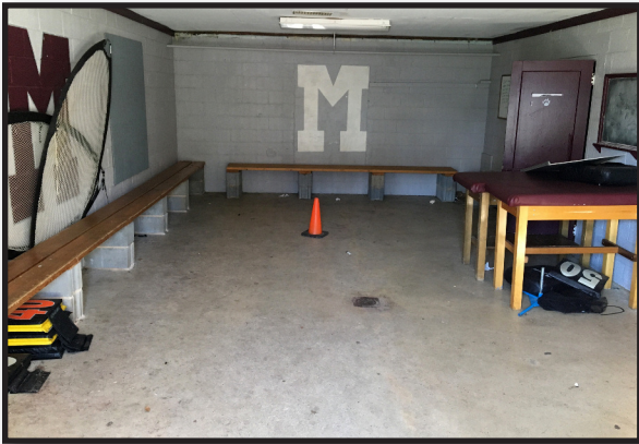
Existing locker rooms accommodate teams of 20