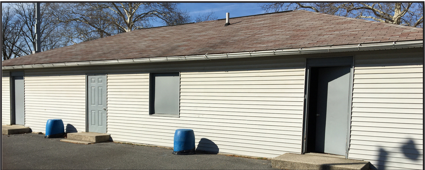
Existing locker rooms