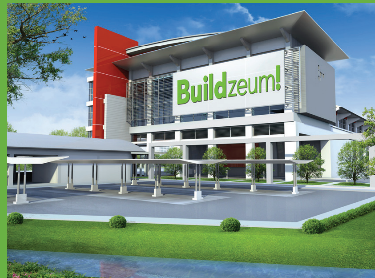
Creative Ways to Support Buildzeum Family Museum

The information in this pamphlet is general in nature and may not apply to all individuals. For advice or assistance in specific cases or whether to make certain a contemplated gift fits well into your overall circumstances and planning, the services of an attorney or other professional advisor should be obtained. © 2017 GivingTools